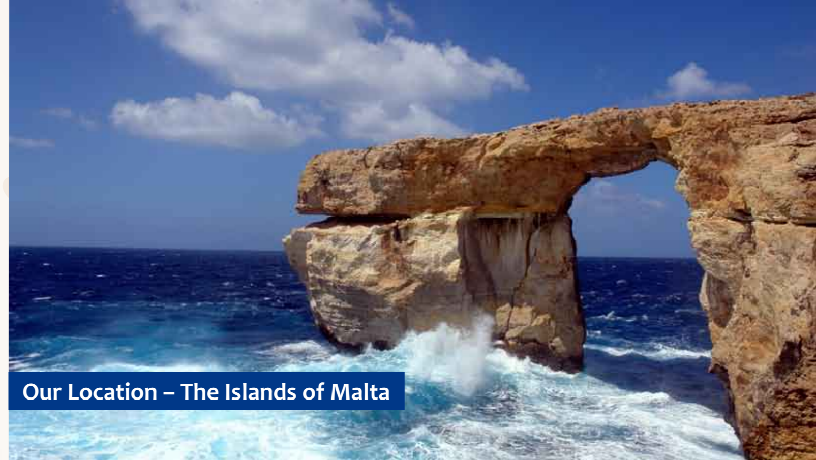
Our Location – The Islands of Malta

We look forward to your choosing BELS for your language course and to welcoming you at one of our centres.